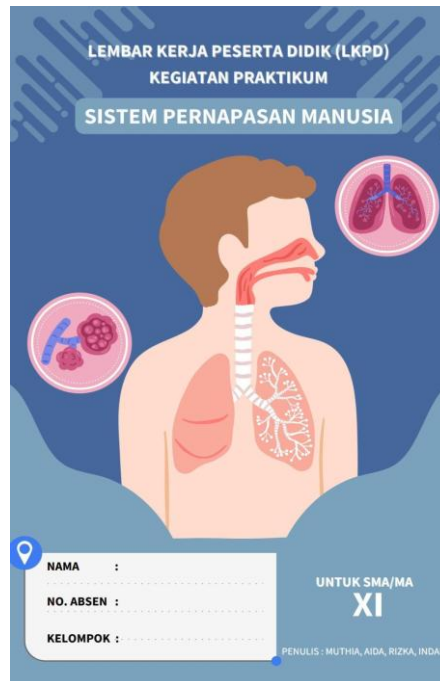
Figure 1. Front cover of LKPD

methods, observation tables to record practicum data and analytical questions that direct students to conclusions. In addition, to improve student learning outcomes, LKPD has special features designed to encourage critical thinking, creativity, and problem-solving skills. These features include data analysis-based questions and reflections to link the practicum results to broader biological concepts shown in Figure 2.