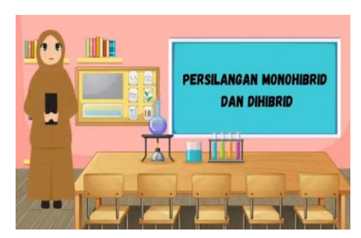
Figure 2. Learning Video Display

the effectiveness of learning videos. Then, in designing the design concept, the developer chose the theme of school and class as the main foundation of the learning video. This theme also underlies the development of the teacher animation named "Miss Zea." The design concept is a guideline for designing learning videos, including selecting theme colors, typography, composition, and animation. Finally, the design process includes the script concept, the core of the learning video content. The script acts as a guideline in the video production process, including the sequence of scenes, places, conditions, and dialogues that will be used as references in the production process (Figure 2).